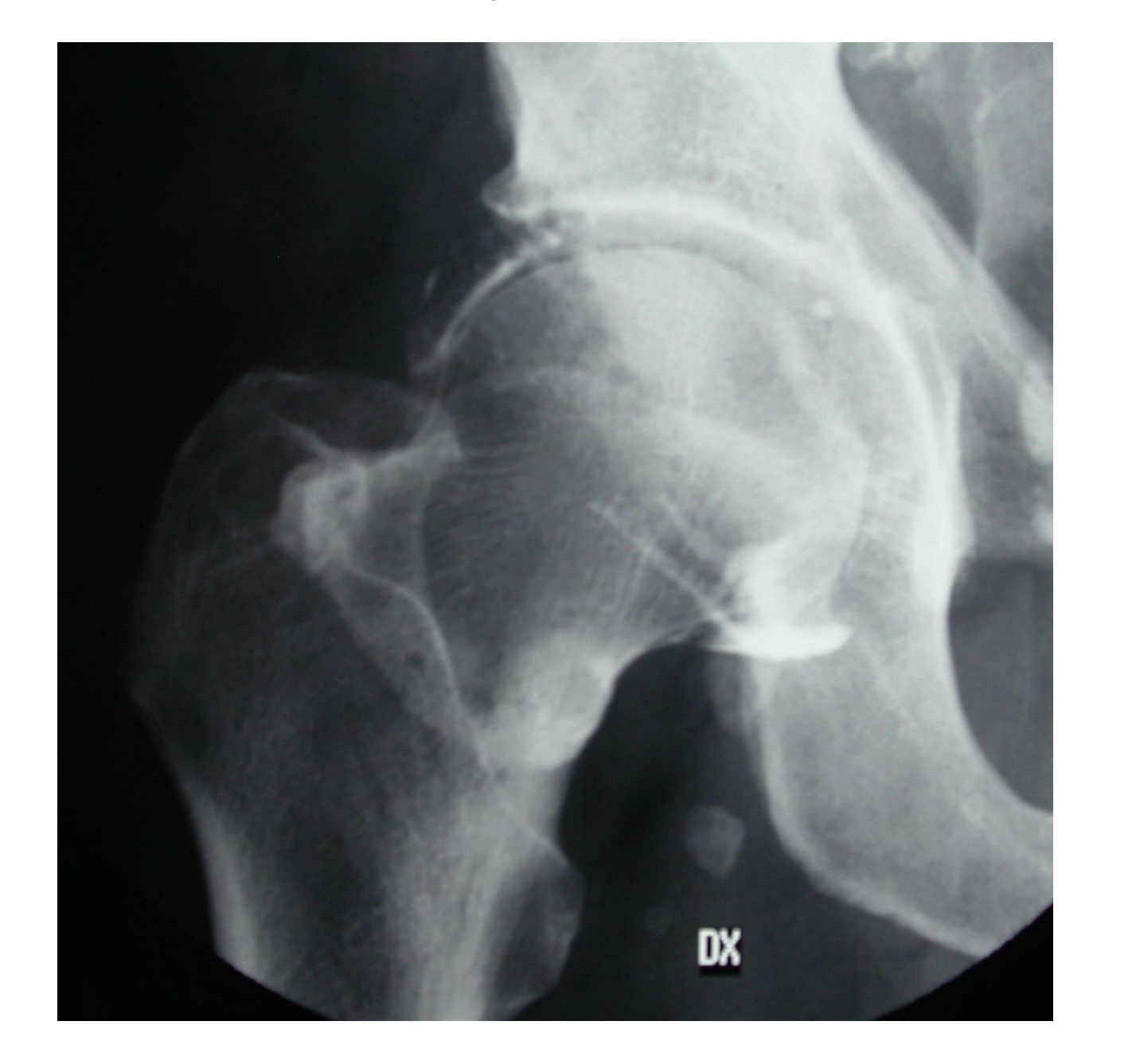
Fig 2. Intra-capsular distribution of contrast agent after Sodium Hyaluronate injection

Fig 1. Contrast agent injection (lopamidol) to check the intra-capsular positioning of the tip needle