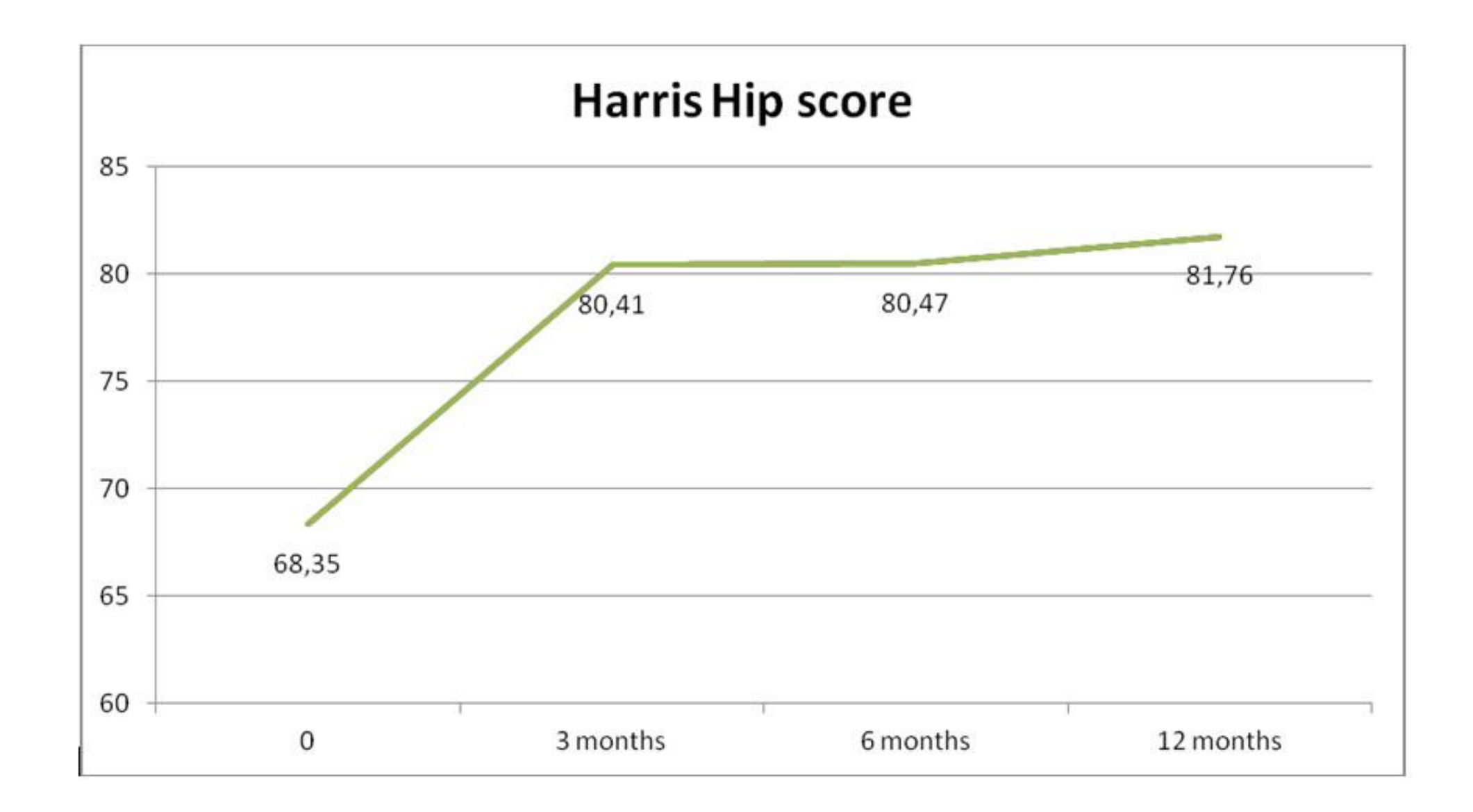
Figure 4: Graph showing variation of Harris Hip Score after

Figure 3: Graph showing reduction in visual analog score after monoinjection